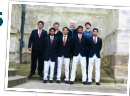
The Malay College tour party in the original court at Eton