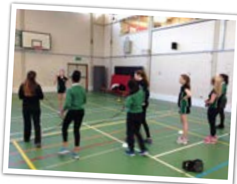
The Streatham and Clapham girls learn how to play Wallball

Some of the girls were initially apprehensive, but they all soon got into it and had fun.