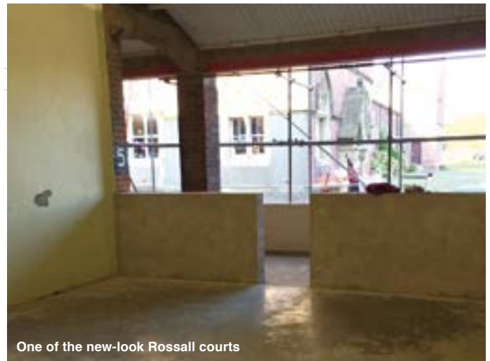
One of the new-look Rossall courts