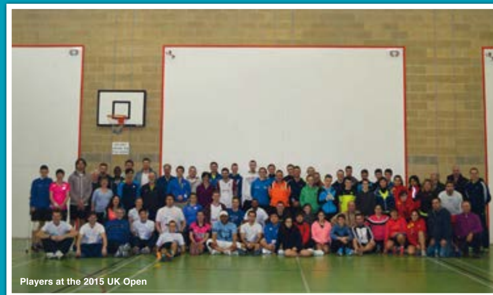
Players at the 2015 UK Open